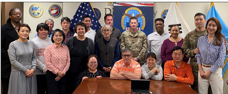
Happy Holidays from DLA Energy Korea!