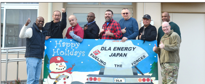
Happy Holidays from DLA Energy Japan!