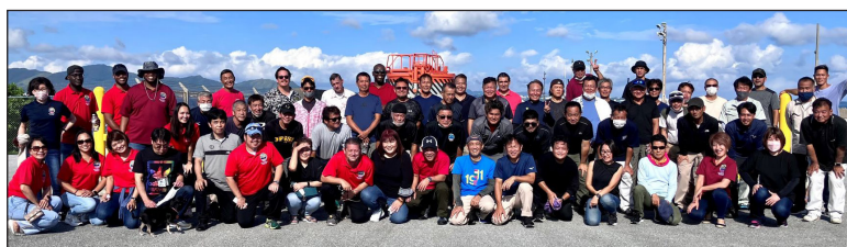
Happy Holidays from DLA Energy Okinawa!