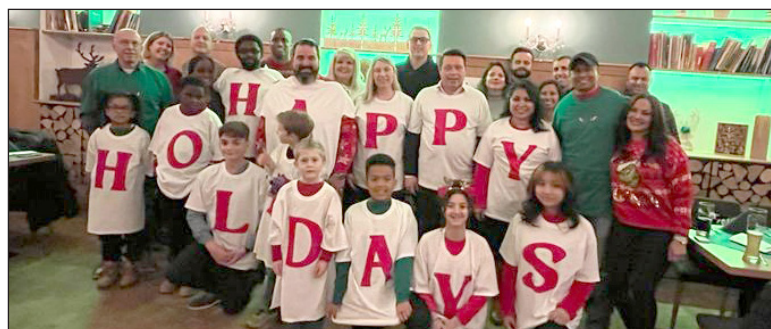
Happy Holidays from DLA Energy Europe & Africa!