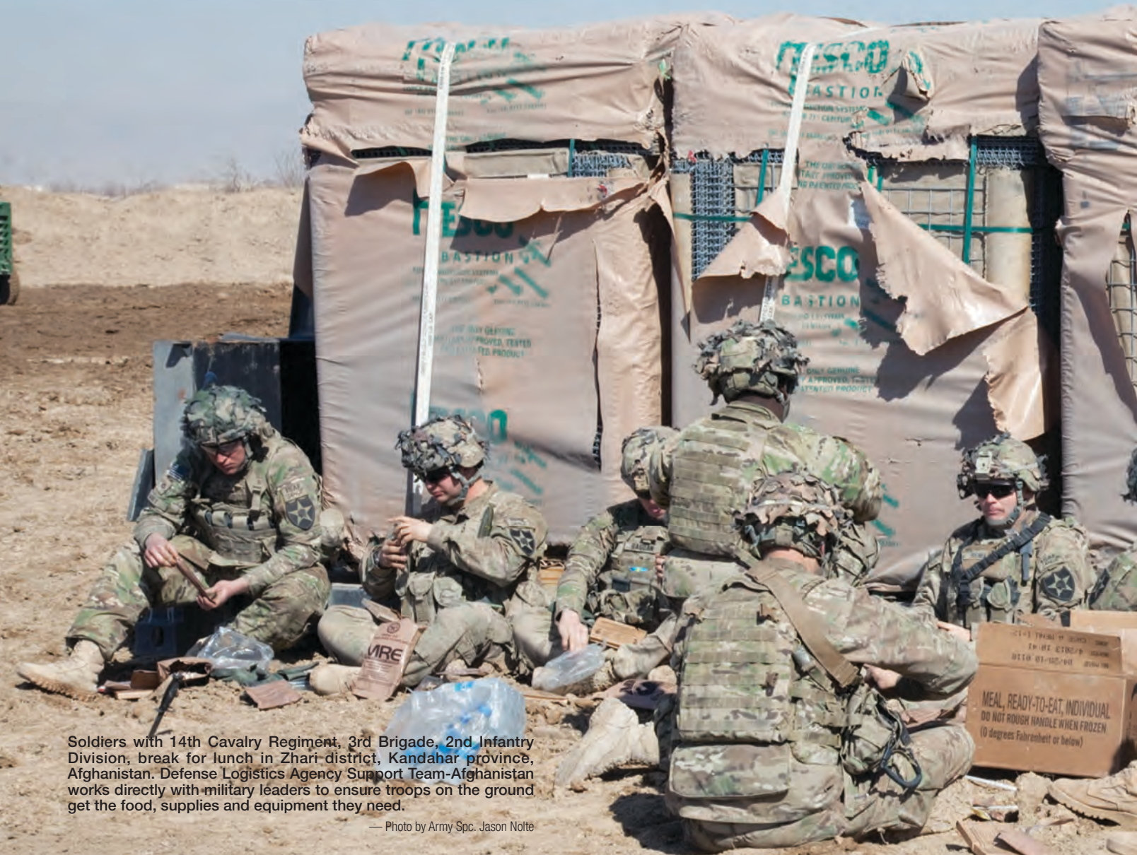
Soldiers with 14th Cavalry Regiment, 3rd Brigade, 2nd Infantry Division, break for lunch in Zhari district, Kandahar province, Afghanistan. Defense Logistics Agency Support Team-Afghanistan works directly with military leaders to ensure troops on the ground get the food, supplies and equipment they need.

Getting the right supplies at the right time becomes crucial. This is where Defense Logistics Agency Support Team-Afghanistan comes in. The team's mix of military, civilian and contractor personnel covering all agency business areas work hand in hand on the ground with U.S. forces to plan and meet their logistics requirements.