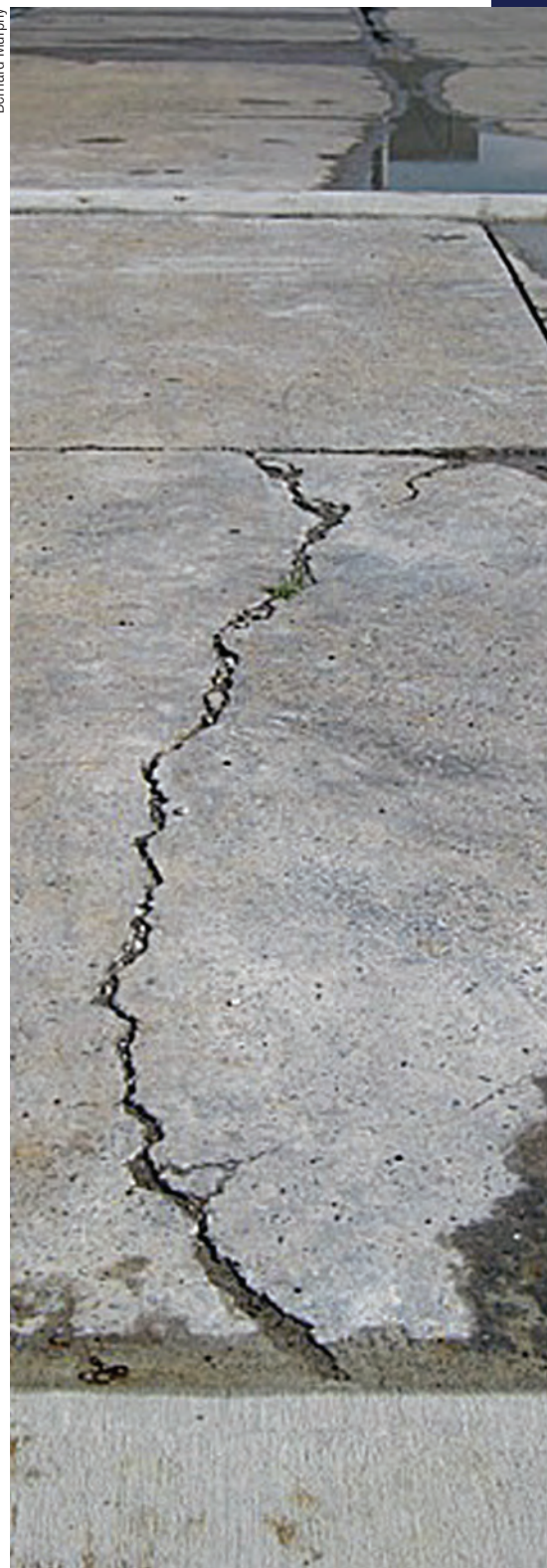
Cracked sidewalks, like this one at Letterkenney Army Depot in Chambersburg, Pa., are being evaluated during facility condition assessments at military sites worldwide as part of the joint effort between the U.S. Army Corps of Engineers and the Defense Logistics Agency.