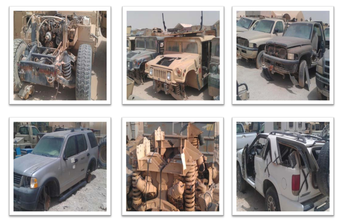
<u>Item 6 – Metallic & Non-metallic scrap Non-vehicular Related With Demilitarization and/or</u> <u>Mutilation Performed by the USG</u>