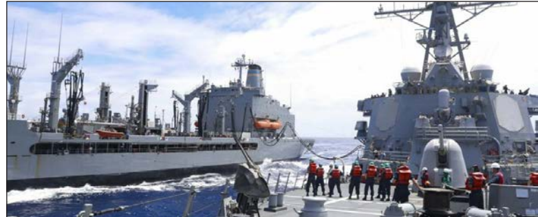
USS Fitzgerald (DDG 62) conducts a fueling-at-sea with replenishment oiler USNS Henry J. Kaiser (T-AO-187) during RIMPAC 2022 on July 13.

Read more in this DLA Today Announcement