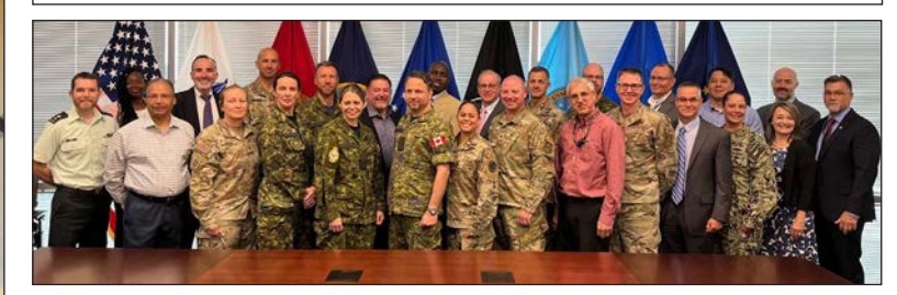
Oct. 26-27, DLA Energy hosted J4 North American Aerospace Defense, U.S. Northern Command and Canadian Armed Forces at Fort Belvoir to discuss collaboration opportunities between the U.S. and Canada.

62K gallons of aviation fuel in support of Kismayo, Somalia. She is a valued team member who not only works expeditiously to adjust customer requirements as needed but also actively helps to train new personnel and customers on fuel orders.