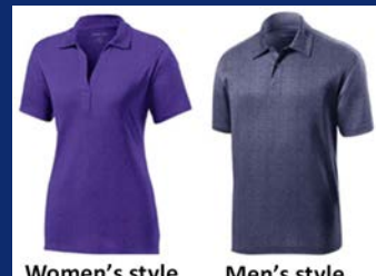
Women's style Men's style

Get details in this DLA Today Announcement