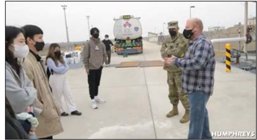
Watch the AFN coverage

DLA Energy Korea sponsored the two-day event giving AP students from the U.S. Army Garrison's Daegu, Humphreys Middle High School and Osan Middle High School a tour, briefing, and panel discussion at the DLA fuel lab at Defense Fuel Support Point Humphreys.