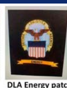
DLA Energy patch