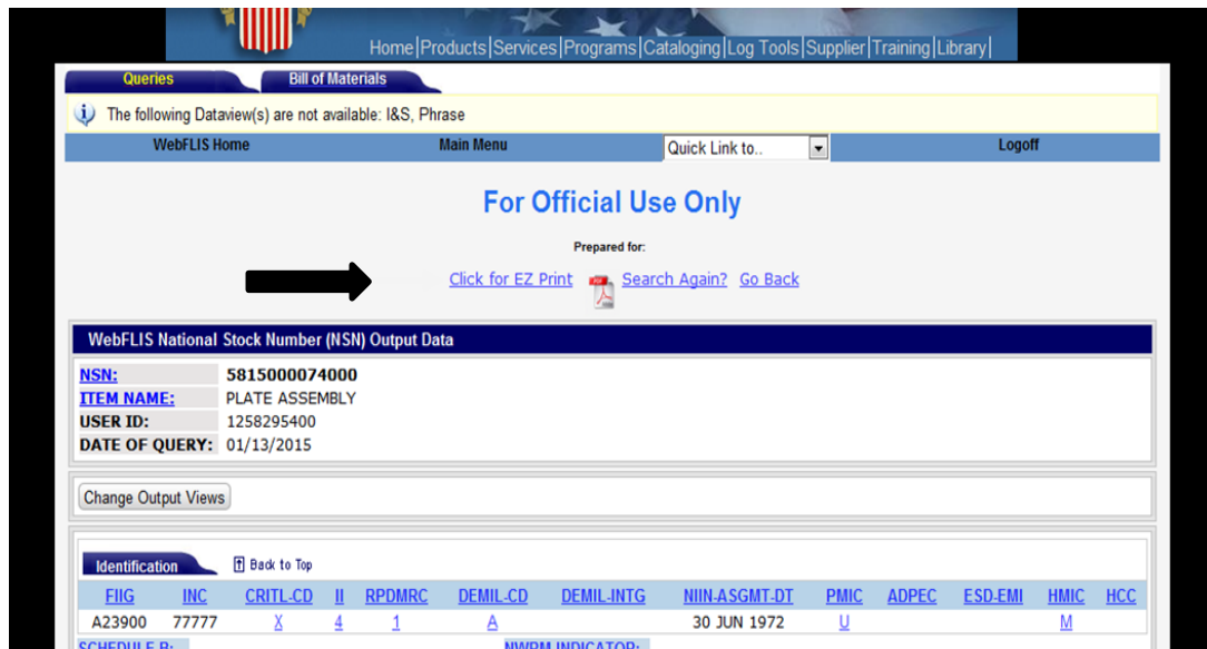
Figure 9 - Click for EZ Print Link

If a user has searched multiple NIIN/NSNs, and would like to print the results, they will need to navigate to each NIIN/NSN using the NIIN EZ Pick List (Figure 10) and print each individually.