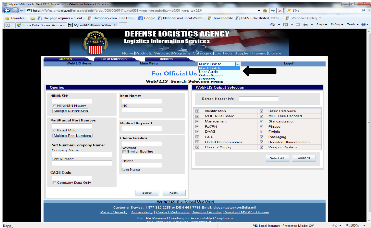
Figure 12 - User Guide Button – Main Menu