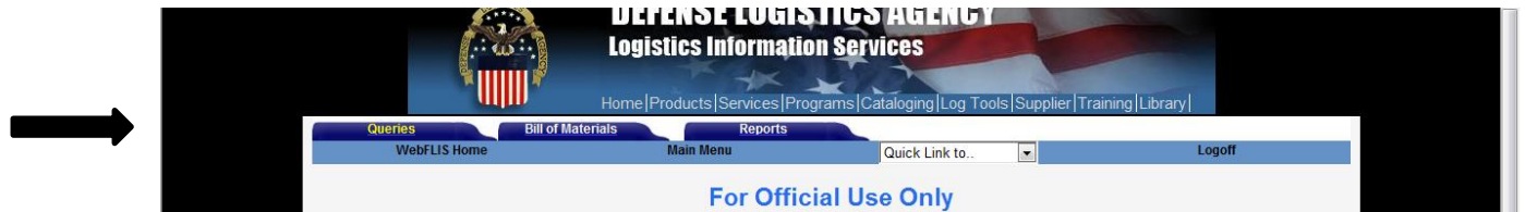
Figure 3 - WebFLIS Query Tabs

There are several new queries included in the WebFLIS application. Each query field has mouse over help that provides data entry rules for each query. All of the available individual and combination queries are listed below under their designated tab ( Table 2 and Table 3 ). Queries new to WebFLIS are highlighted in yellow and the associated functionality is described in the "Query Description and Changes" column.