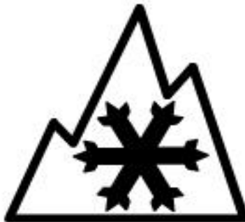
Severe winter traction icon

NOTE: Some newer tires are designed for use in severe snow conditions and are marked on at least one sidewall with the letters "M" and "S" (e.g., MS, M/S, M&S, M+S, etc.) plus have a pictograph of a mountain with a snowflake. If you need more information on tires designed for severe snow conditions contact the CTQP Administrator (at (810) 677-5745) or refer to Rubber Manufacturers Association, Tire Information Service Bulletin, Volume 37, Number 2, February 1999 and titled "RMA Definition for Passenger and Light Truck Tires for Use in Severe Snow Conditions." An example of the mountain/snowflake is shown below.