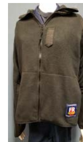
FR Fleece Jacket

USFF developing 2- Piece FR uniform for all operational assignments