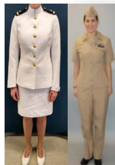
Women Skirt/Slacks Redesign

Improve the "Standard Fit" for all skirts and slacks