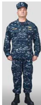
NWU Type I

RTC: Oct 2017 NEX: Jul 2017 Mando: Oct 2019