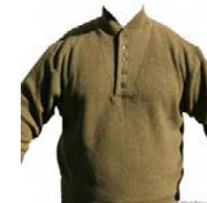
Brown Submarine Sweater

Submarine community initiative to bring back brown sub sweater