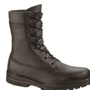
Improved Black Safety Boot