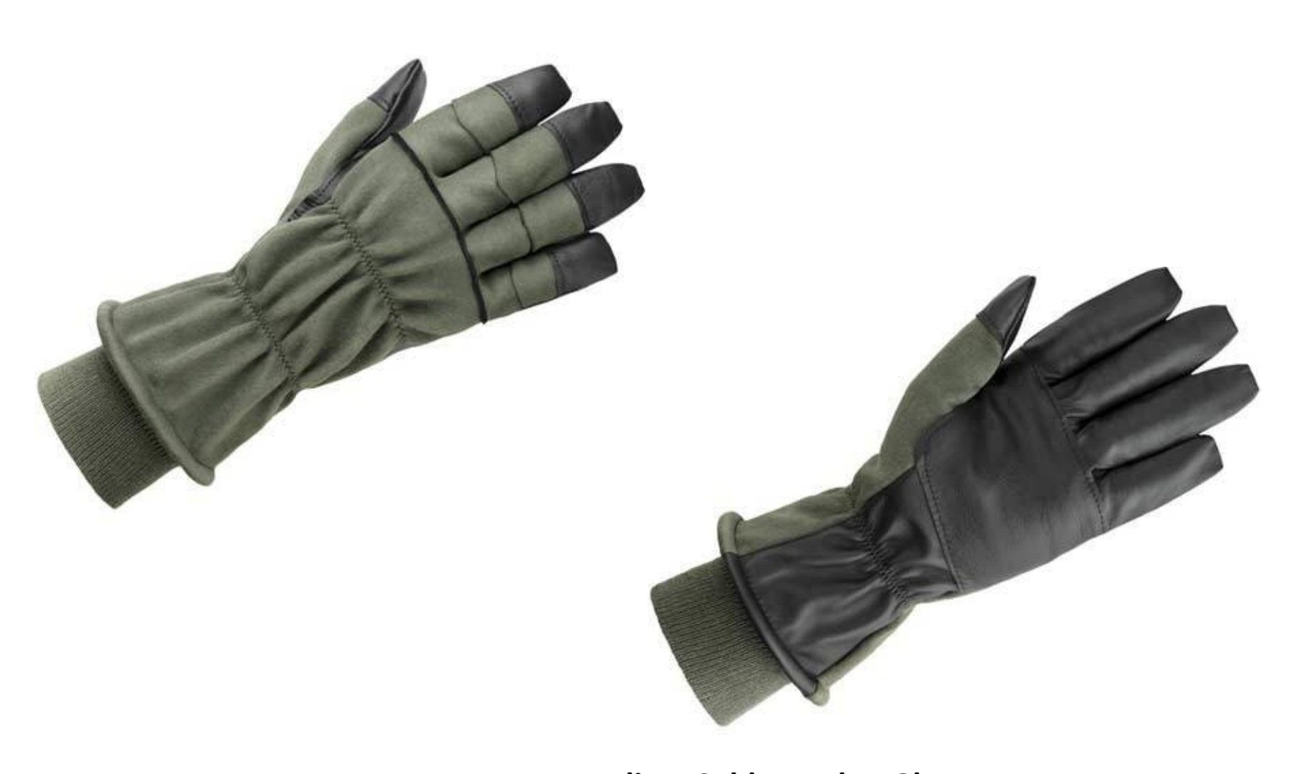
HAU-15P Intermediate Cold Weather Glove

AFLCMC... Providing the Warfighter's Edge