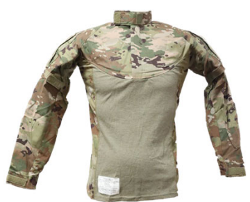
Female Ballistic Combat Shirt (FBCS)