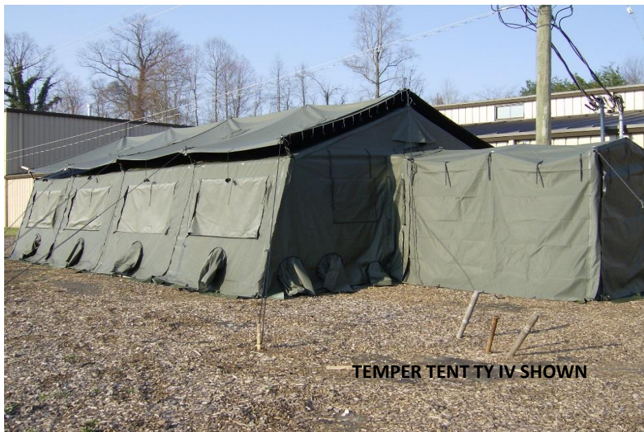
TEMPER TENT TY IV SHOWN