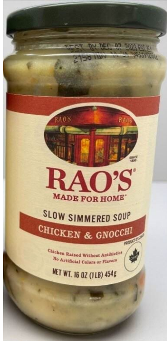
Figure 2: Correctly Labeled Soup Jar