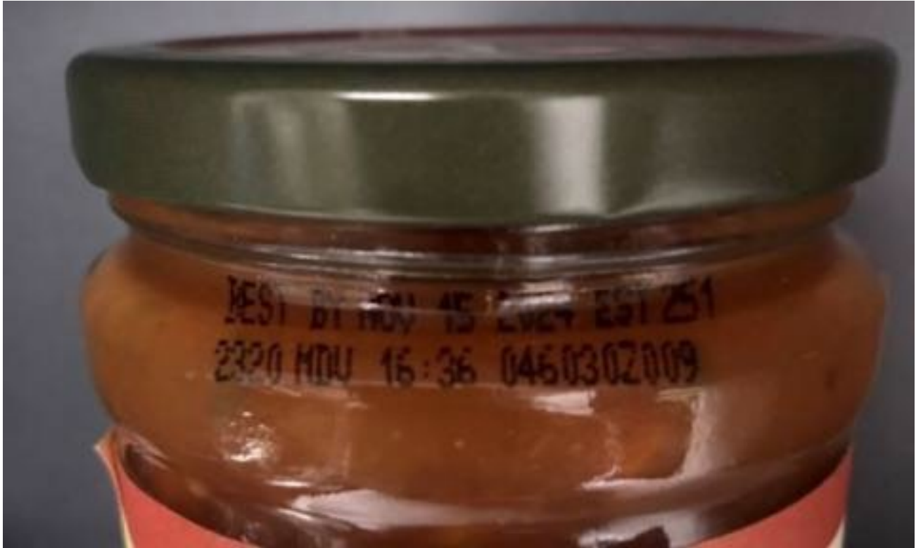
Figure 3: Location of code date

*Immediately discontinue use/sale of products and place on medical hold. Contact your supplier for disposition instructions.