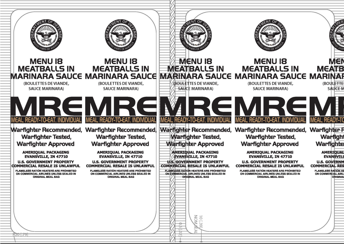
FIGURE 1. Example of Meal Pouch Graphics