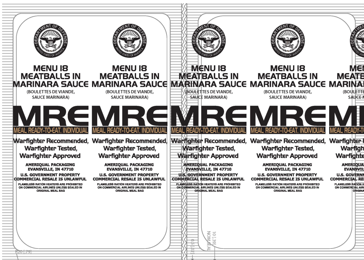
FIGURE 1. Example of Meal Pouch Graphics