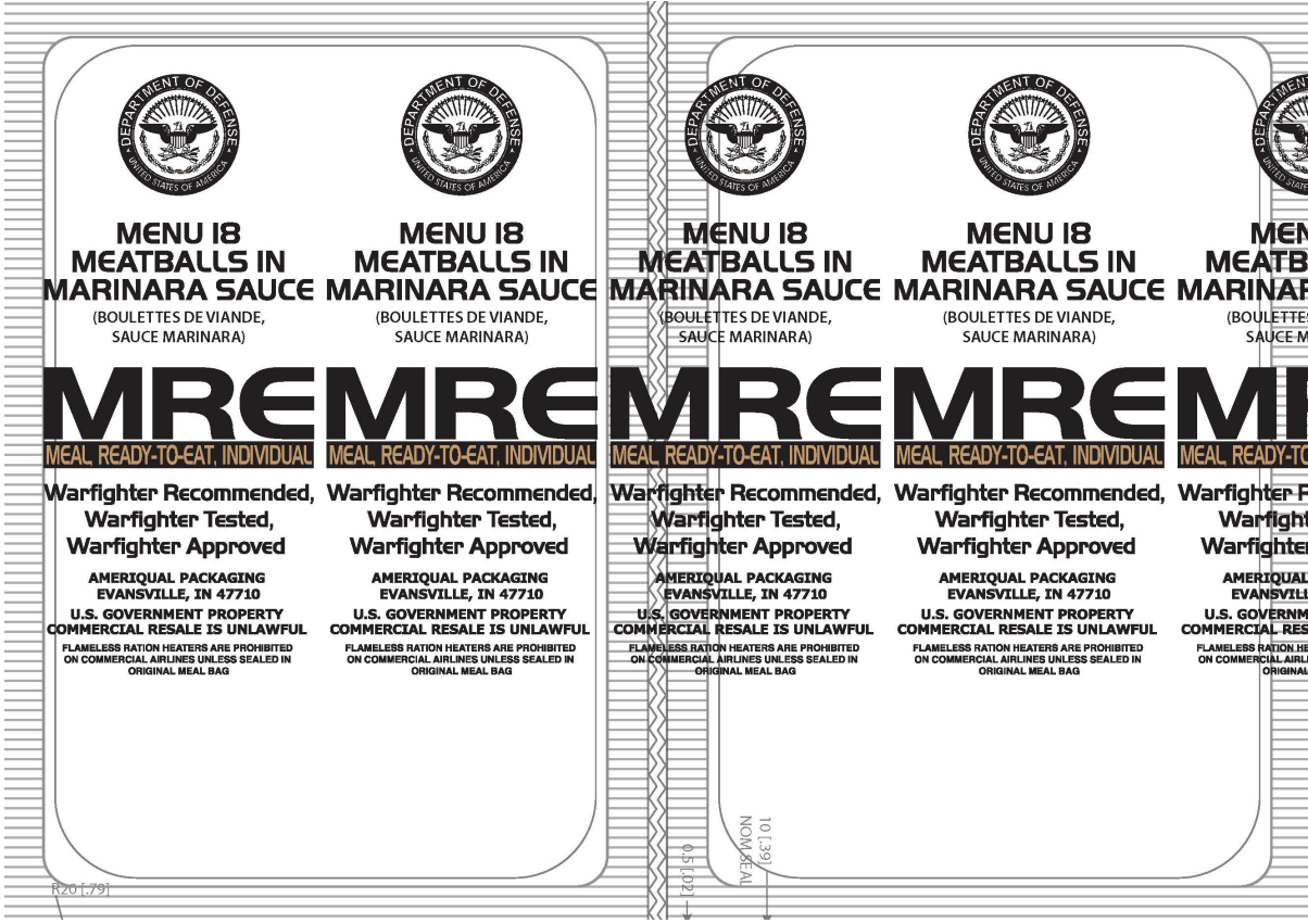
FIGURE 1. Example of Meal Pouch Graphics

B. Unit loads. Unit loads shall be marked in accordance with DLA Troop Support Form 3556.