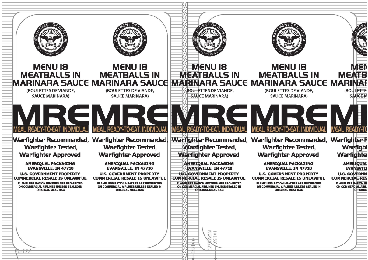
FIGURE 1. Example of Meal Pouch Graphics