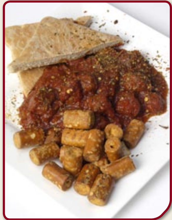
MRE™ XXIX ITEMS, MENU 8