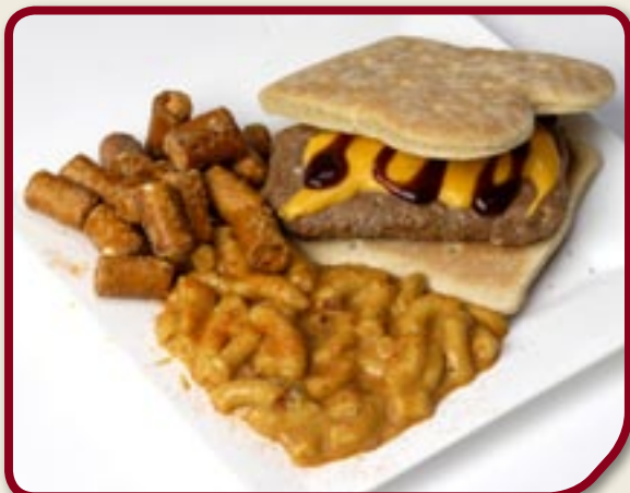
MRE™ XXIX ITEMS, MENU 18