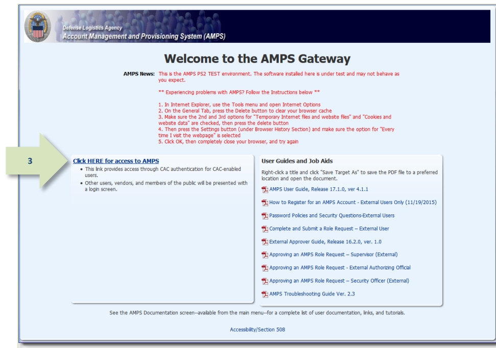
Figure 22: Welcome to the AMPS Gateway